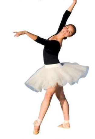
2.25 Hour Class