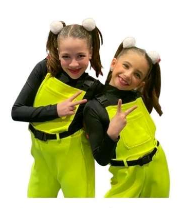
45 Minute Class