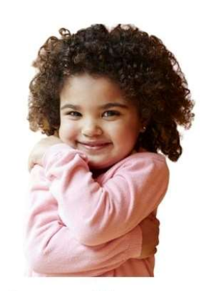
30 Minute Class

Membership Fee- $35.00 per person, $30.00 per person (family of 2), $25.00 per person (family of 3)